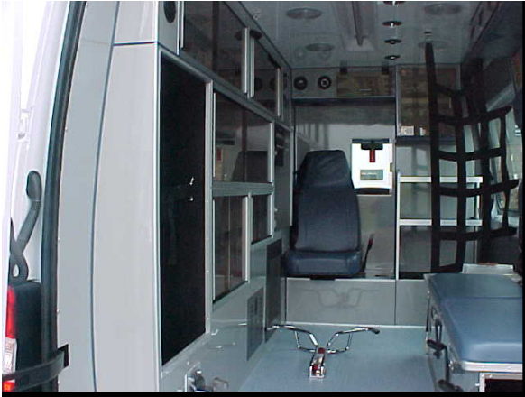
Inside Rear Doors