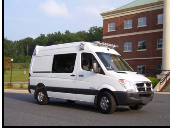
Front ¼ View