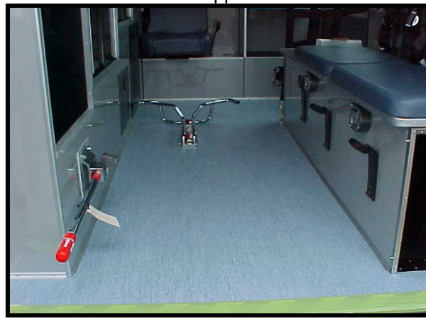
Patient Area Floor