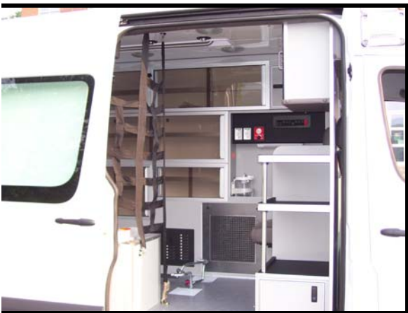
Inside Curbside Door