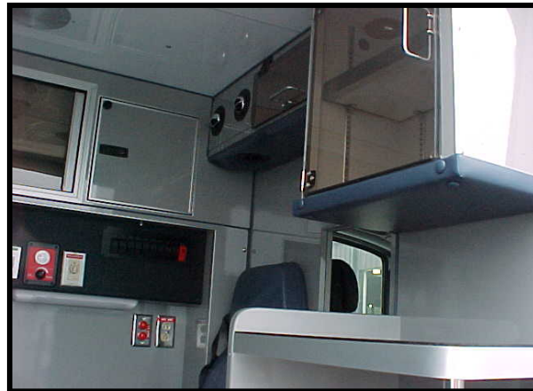
Bulkhead Upper Cabinet